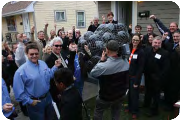
Balloons were popped by guests at the Official Opening of the Windsor 5 Exhibition House to demonstrate carbon footprint reductions as a result of the project.

Each house has received a different package of retrofits to help Windsor Essex determine which mixture produces the best cost-benefit ratio. The energy